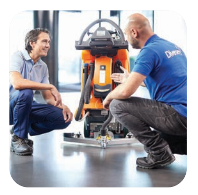
Supporting & Training Whether it's on site or in our training centres in Northampton and Dublin.