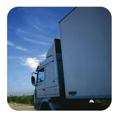
Delivering Our fleet of vehicles deliver nationally next day if necessary.

Surveying, Demonstrating & Recommending Ensuring you and your client get the right equipment for the right application anywhere in the UK and Ireland.