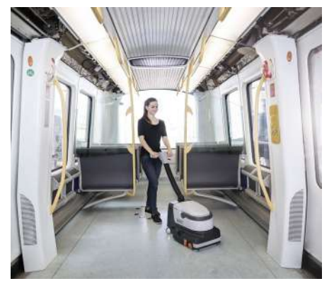
Easy to maneuver thanks to its pivoting wheels and the ergonomic adjustable handle