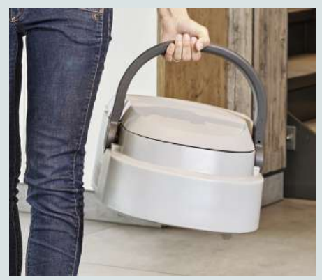
Tank-in-tank design for easy handling when emptying and refilling