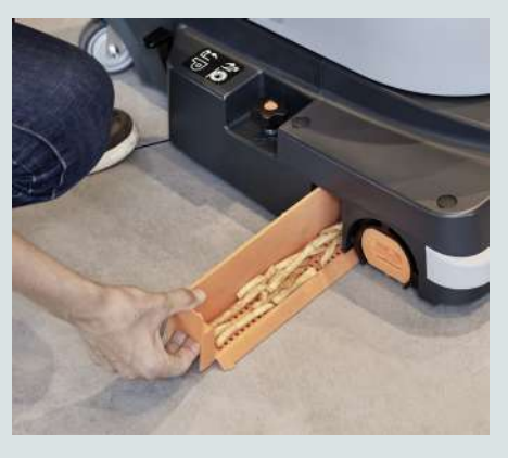
Easy access to emptying and cleaning the debris tray