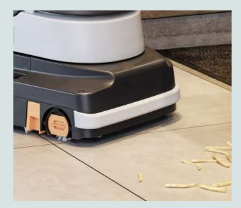
Easy pick-up of larger debris as front squeegee can be lifted