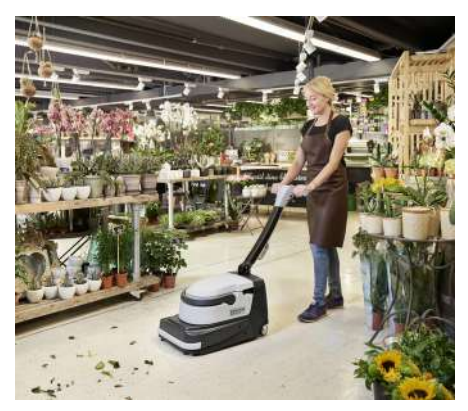
Cleaning floors with ease and speed - sweep, scrub and dry at the same time